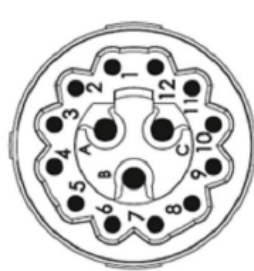
Cable 12+3 Wires